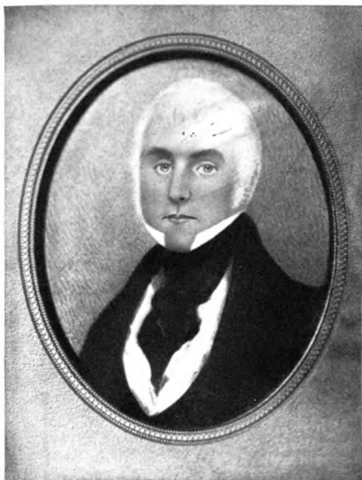
DR. JOHN McLOUGHLIN