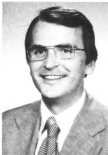
Bruce K. CHAPMAN Republican

My priorities after nine months in office are still curtailed spending, reduced paperwork for citizens, and Legislative approval of your right to vote on basic structural changes in Olympia. Recent scandals underscore the need for clear, reliable checks on conflicts of interest. I am pushing for a more enforceable Code of Ethics for all state officeholders.