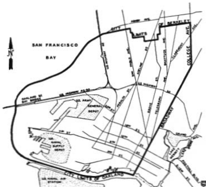
FIGURE B: Map of a Prohibited Area