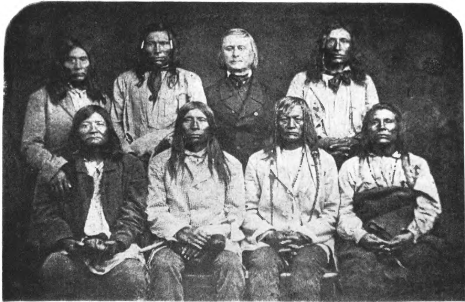
A DELEGATION OF INDIAN CHIEFS IN OREGON.