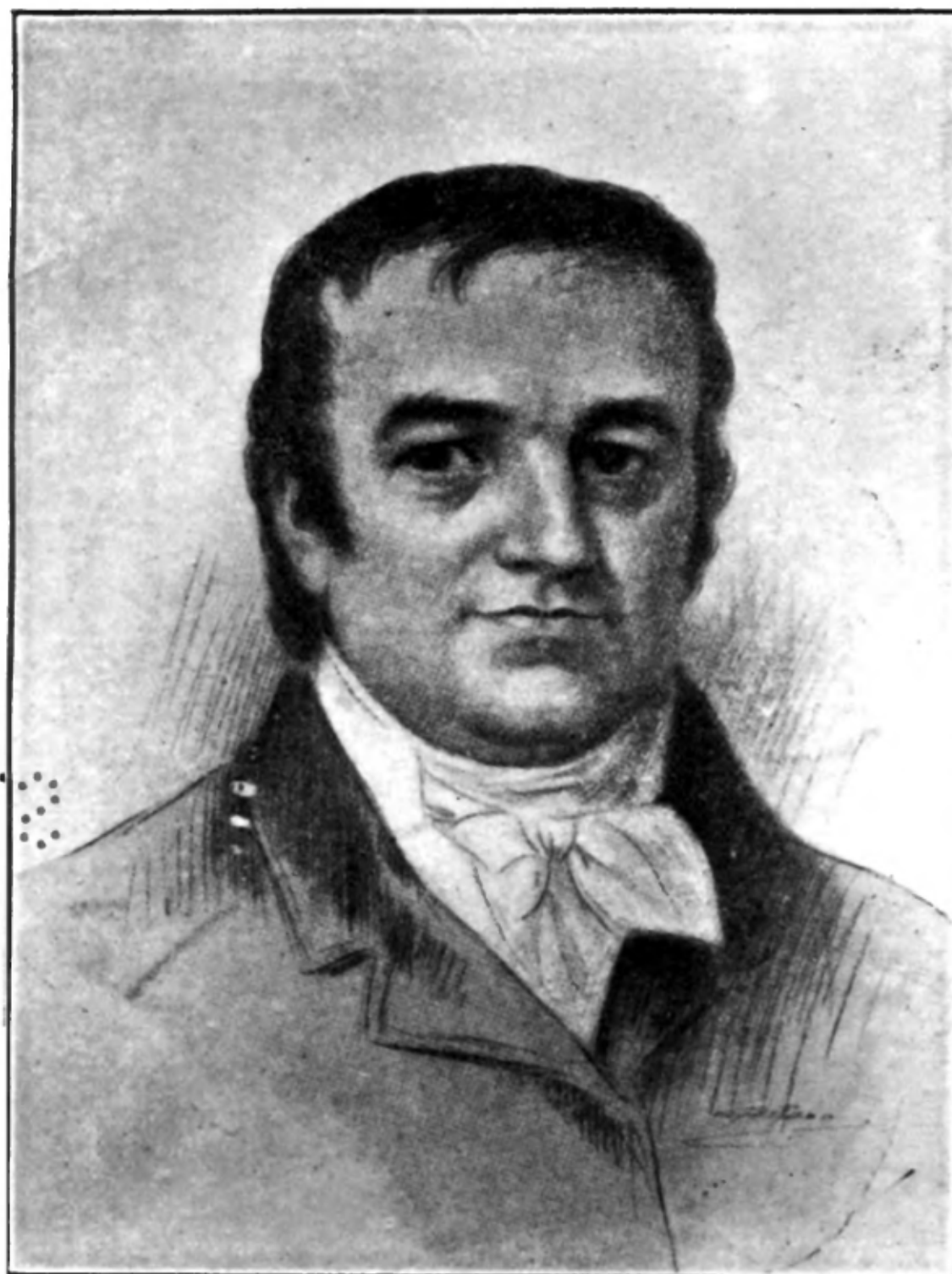
JOHN JACOB ASTOR.