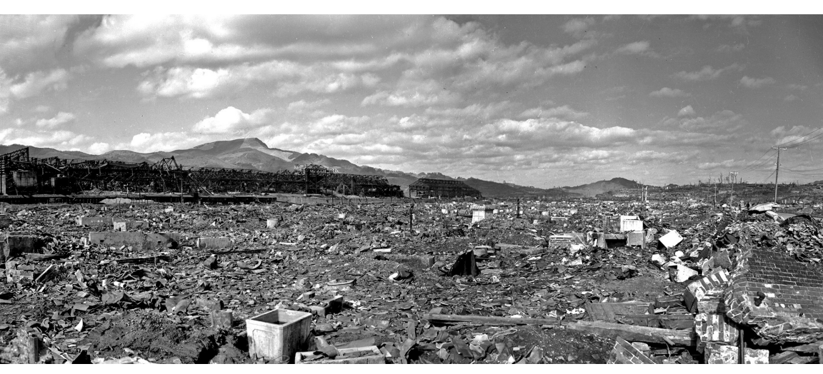
The plutonium-filled weapon known as "Fat Man" detonated over Nagasaki at 11:02 a.m. on August 9, 1945, killing an estimated 60,000 people. This picture of Ground Zero captures the aftermath of the blast. Joe O'Donnell

More powerful than Little Boy , the atomic bomb dropped on Hiroshima, Fat Man was filled with plutonium-239. The to-