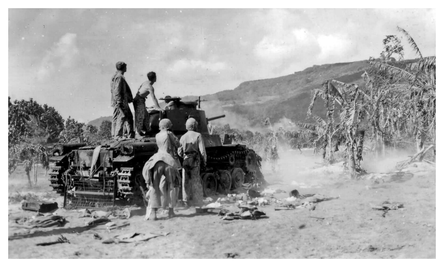
The 2nd Marine Division with a captured Japanese tank in Saipan, 1944. The battle for Saipan in World War II was dubbed "Japan's Pearl Harbor."

Savage fighting erupted around Mount Tapotchau. Eventually, the Japanese were trapped in the northern part of the island. In a final suicidal "banzai" charge, the largest of the war, 3,000 Japanese troops perished. The battle also killed more than 3,000 American troops, but the Japanese fared worse. Of 30,000 troops, only 1,000 survived when the island was secured on July 9. Japanese civilian deaths, the result of mass suicides, were deemed heroic by the Japanese government. General Saito, who died after the battle by ritual suicide, had labeled the Japanese civilians martyrs: "There is no longer any distinction between civilians and troops. It would be better for them to join in the attack with bamboo spears than be captured."