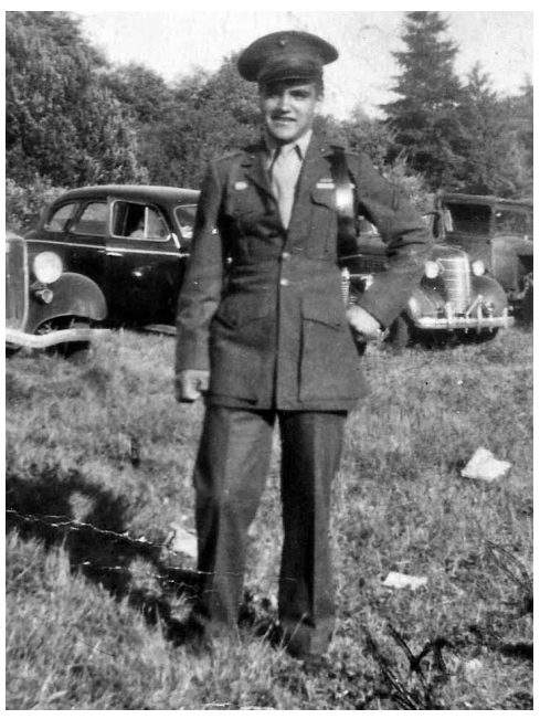
Jones' tour of duty took him from the jungles of Saipan to postwar Japan where he patrolled the ruins of Nagasaki in the aftermath of the bomb.

Jones couldn't believe what he found when he and 27,000 American troops occupied the devastated industrial city.