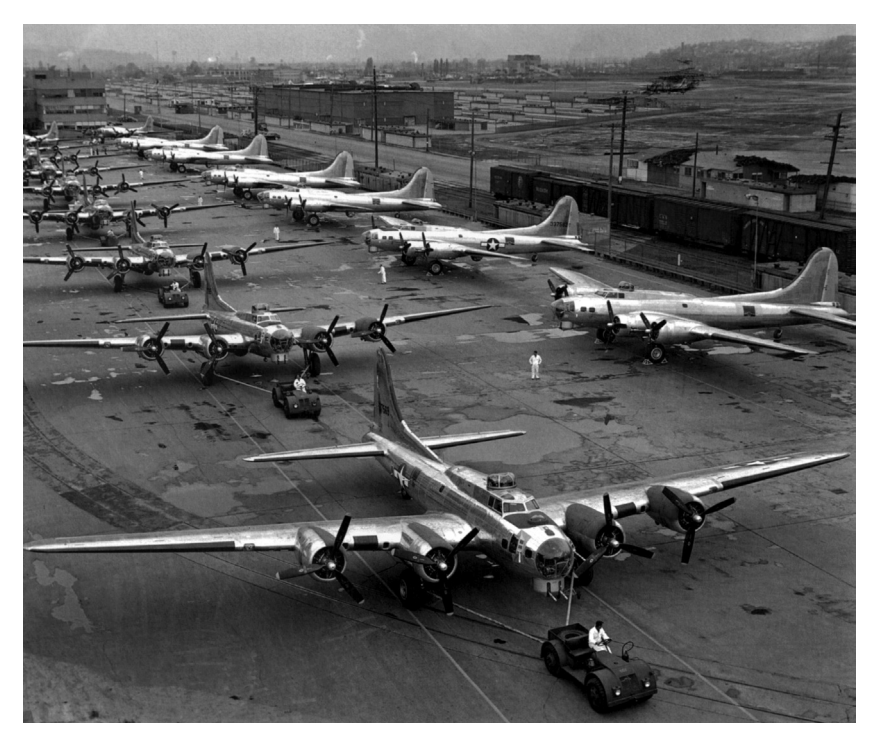
At the peak of production, Boeing Plant 2 in Seattle produced sixteen B-17G's a day.

"The riveters followed us, and the noise rattled your head: rata-tat! They never told us to wear earplugs, so I have a hearing loss. They were more concerned about us getting dehydrated, so we had to suck on these salt balls the size of a gumball." She makes a face that tells you they tasted awful.