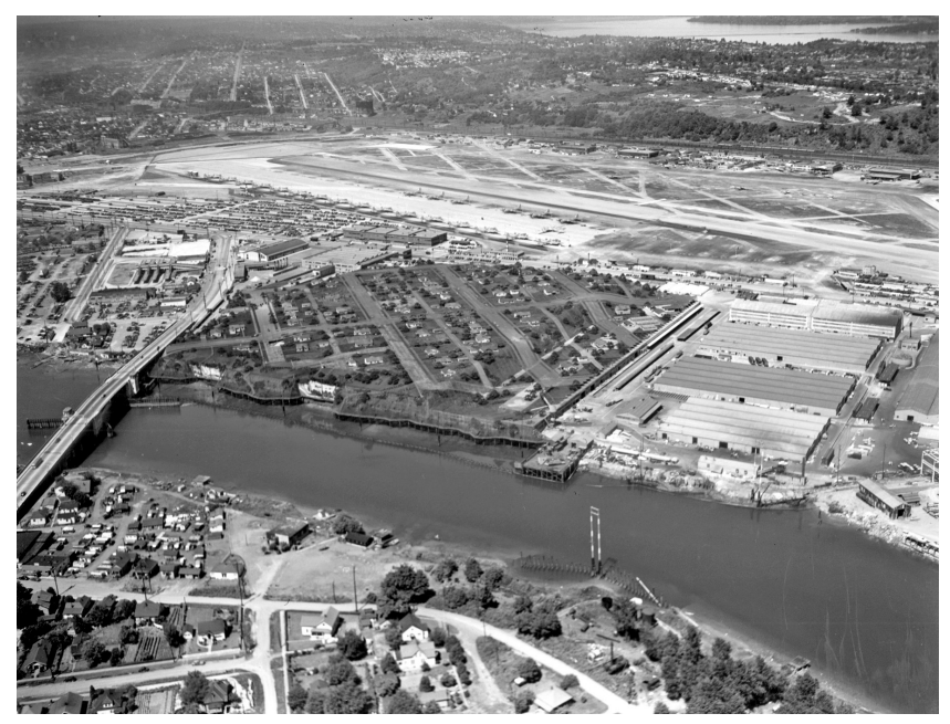
Boeing camouflaged Plant 2 to make it appear a suburban neighborhood from the air in the event enemy planes made it past the coast.

worker. Your husband—your son—your brother or boyfriend will be proud that you are doing your part in building the axis-blasting Flying Fortresses."