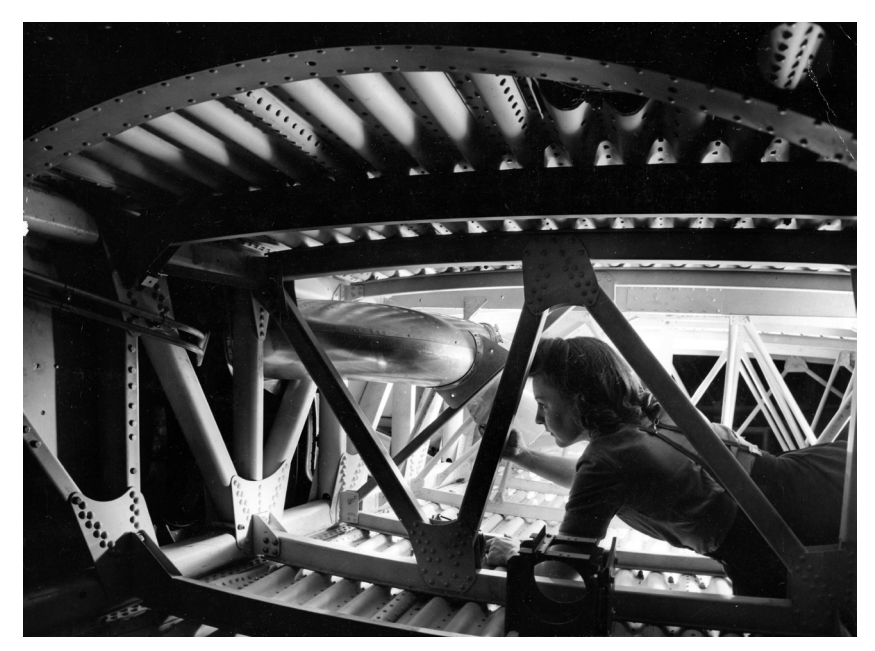
A Rosie works inside a B-17 wing.

"When you build a B-17 wing, there's the tubular ribs called trusses; there's the corrugation over the ribs and there's the aluminum skin. Each process requires that the person who goes through first marks where the holes should be drilled. Little X's. I would lie down and wriggle in. We used spring-loaded fasteners called 'clekos' that held the corrugation to the ribs after we drilled the holes. It was a temporary rivet. I'd go through first and do all that; then come back when the corrugation was on. Next came the skin. You got through one level, then there were two more. So you were going up and down, up and down, back and forth. It's funny I don't dream about that! I think I can still feel the heat if I close my eyes and think about it. It got so terrifically hot in the plant during the summer months, even with the doors wide open. One day I wasn't wearing my hard hat because it was so hot. There I was, inside the wing tip, wriggling my way through the ribs. A worker on the next level dropped her bucking bar—the tool used to form the head of the rivet—and it hit me on the head. I've got a scar." She points to her head. "I had to go to the nurse's station and get patched up. I learned a lesson! Wear your hat!