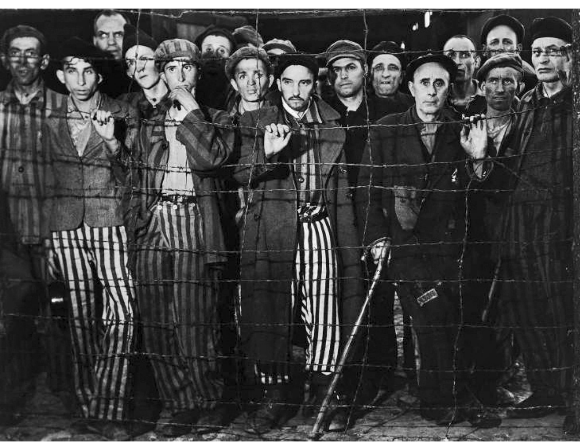
Stripped of their clothes and belongings, the interred are given uniforms. The lucky wear shoes. "You're a prisoner," Moser said. "Your life is not your own."

were reduced to skin and bones. Their shapeless figures were covered in gray, tattered clothing bearing identification numbers and badges. The lucky prisoners wore shoes.