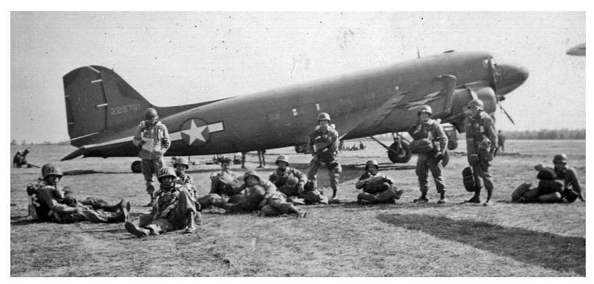
Paratroopers prepare for a practice jump from a C-47.