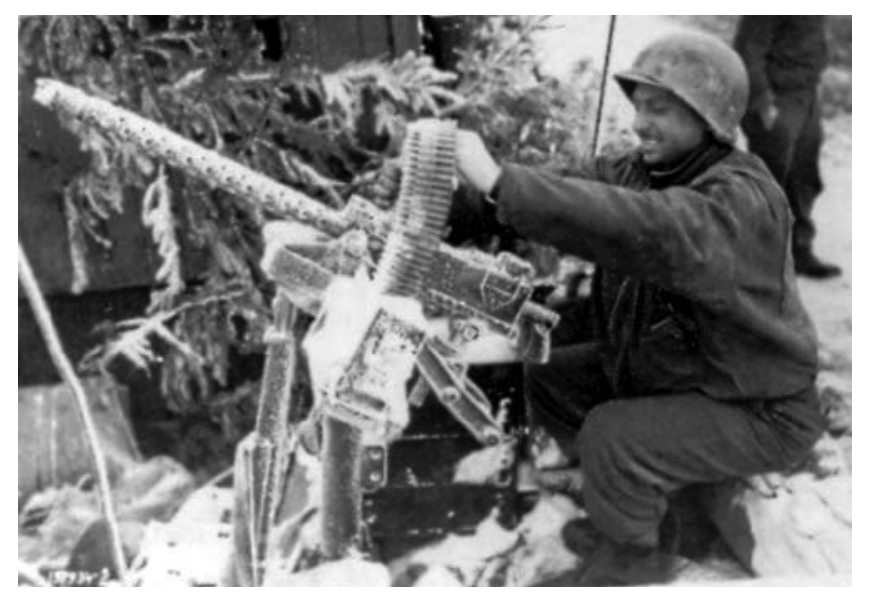
A member of the 517th struggles with a frozen machine gun at the Bulge.

The paratroopers arrived at Soissons, an ancient town northeast of Paris, on December 12, 1944. They were happy to