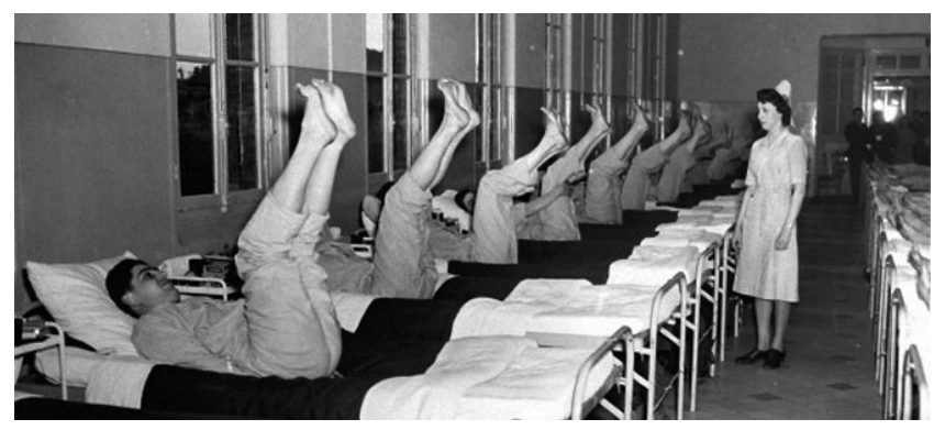
GI's with frozen feet doing an elevation exercise in a military hospital in England under the watchful eye of a nurse.

He was lucky he could be evacuated—and that his feet were not in worse shape. "The only time I saw Paris during World War II was out the back window of an ambulance. There