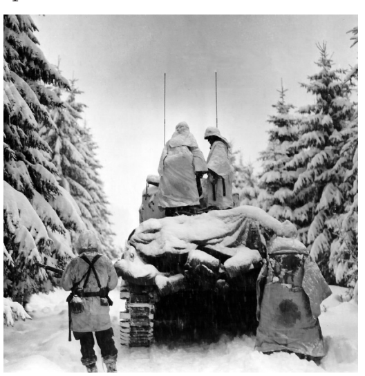
It was slow going at the Bulge in the winter of 1944-45.