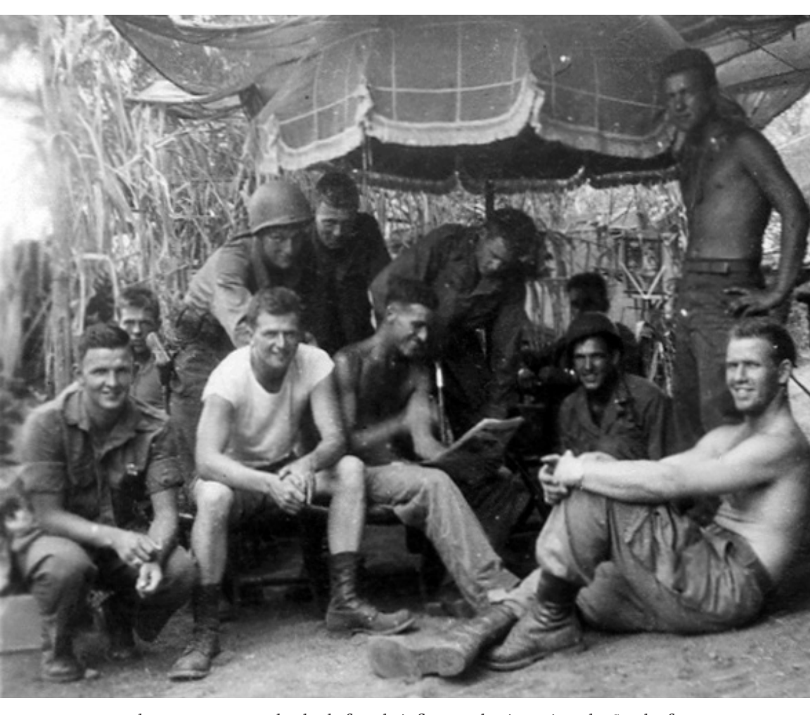
517th paratroopers on the day before their first combat jump into the South of France.

the day before D-Day. While some American soldiers were being hugged, kissed and showered with flowers and Chianti, others, including the 82<sup>nd</sup> and 101<sup>st</sup> Airborne, were poised to enter savage combat at Normandy.