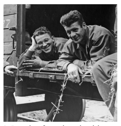
In December of 1944, the 517th and thousands of other GI's lurched north by rail in French boxcars—the stubby "40 et 8's" designed to carry 40 men or eight horses.