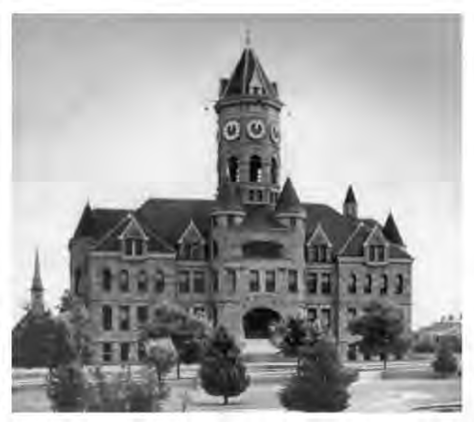
Thurston County Courthouse The state purchased the courihouse in 1901 and was used by the legislature from 1905 to 1928. The building, which is located at Legion and Washington St., now houses the offices of the Superintendent of Public Instruction.

As the session closed most newspapers applauded the Governor's veto of the capital removal bill. They also generally were complimentary of the passage of the Railroad Commission legislation, though the <u>Seattle Times</u> maintained the bill was passed for all the wrong reasons. Generally, the press gave the Legislature mediocre marks and a couple of the larger papers complained that there was far too much horse-trading. As is customary, all seemed relieved when the Legislature went home without having done too much damage.