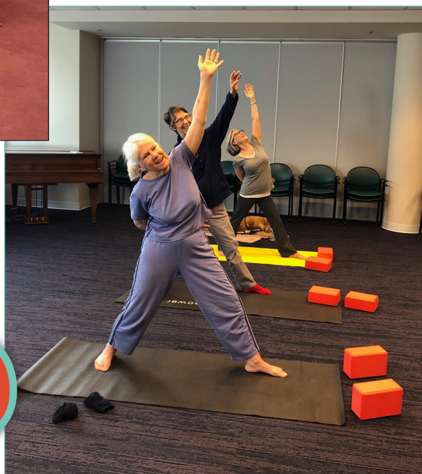
Three yogis in a reverse triangle pose