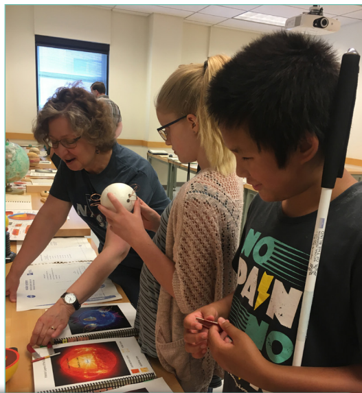
Exploring tactile models of the sun and solar flares at UW Planetarium

Be sure to subscribe to DOTS: WTBBL's Youth Patron Newsletter via the link on the Youth Services page of the library's website for more information on the goings-on at WTBBL!