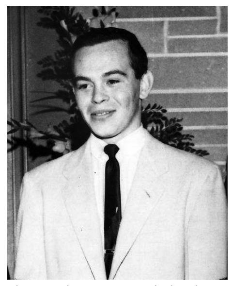
The Assiniboine-Sioux worked in the orchards and fished throughout his youth while maintaining nearly perfect grades.