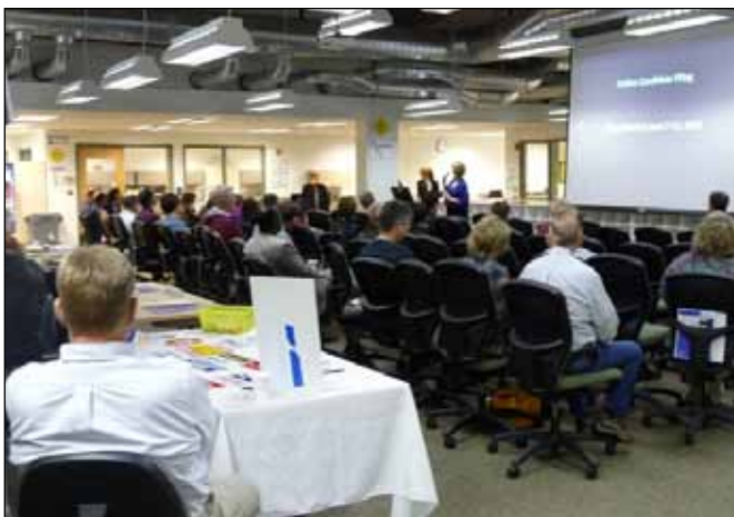
Candidate workshop in Pierce County