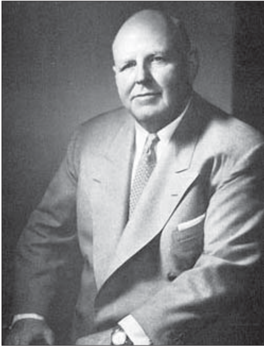
Dave Beck, President, 1952-1957 International Brotherhood of Teamsters