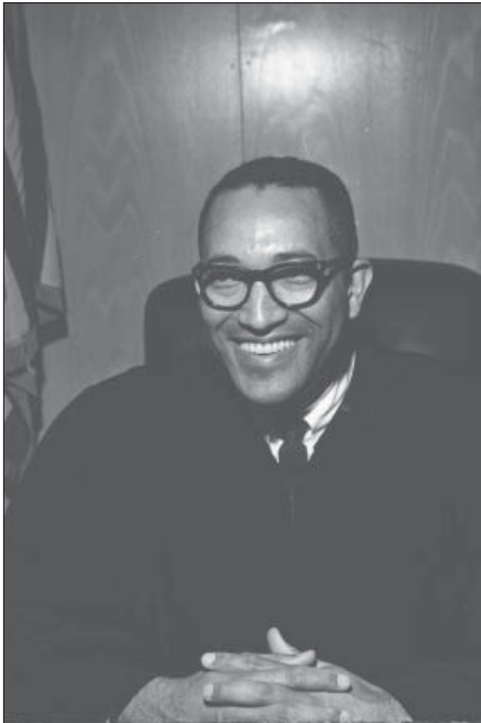
Superior Court Judge Charles Z. Smith, 1969 Washington State Supreme Court Collection

these families and children. I knew what the solution was, but the solution was not available because of lack of funding, or lack of understanding on the parts of the people in power. So I had to get away.