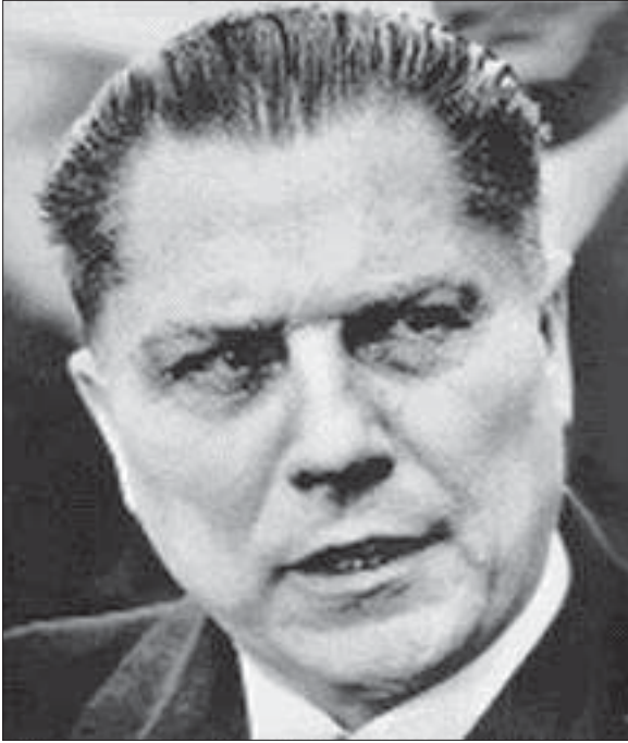
Jimmy Hoffa, President, 1957-1964 International Brotherhood of Teamsters