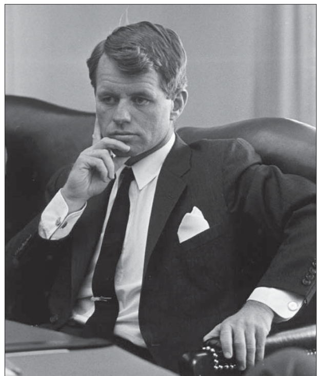
Robert F. Kennedy, United States Attorney General, 1961-1964