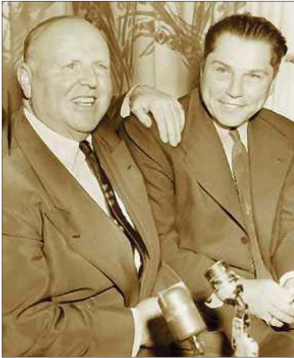
Dave Beck and Jimmy Hoffa, 1956

extent. The only label that I could put on Dave Beck was that he was an arrogant son of a bitch. And I don't have that same feeling about Mr. Hoffa.