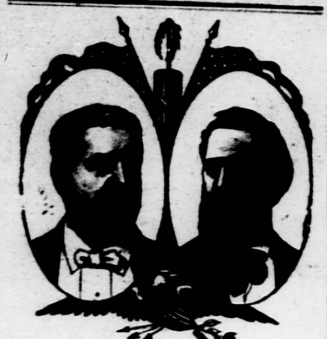
For President, W. S. HANCOCK, Of Pennsylvania. For Vice President, WM. H. ENGLISH, Of Indiana.